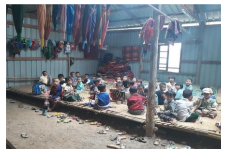
Nursery students studying inside the tin shack building.