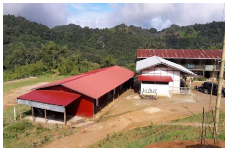
Tin Hted High School campus view from the hill.