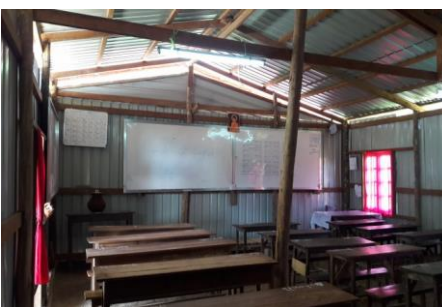
The construction is mainly made of corrugated metal sheets and the interior becomes unbearably hot during the hot season.