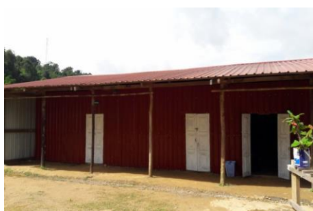
The tin shack building is unhygienic, an unsuitable learning environment, and in dire need of replacement.