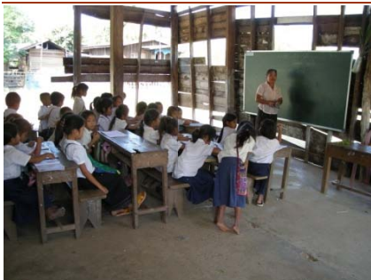
Many walls are missing