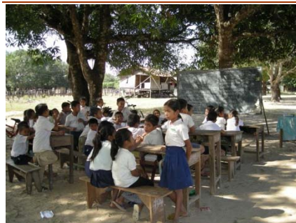
Class is held under the sun