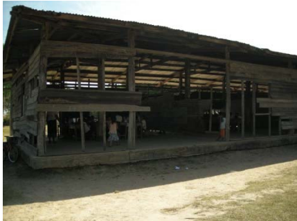
Difficult teaching conditions