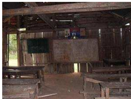
The inside of a classroom