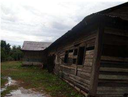
Walls insufficiently protecting children