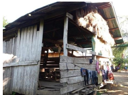
Storage space used to hold classes