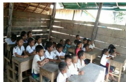
Eager students attending class