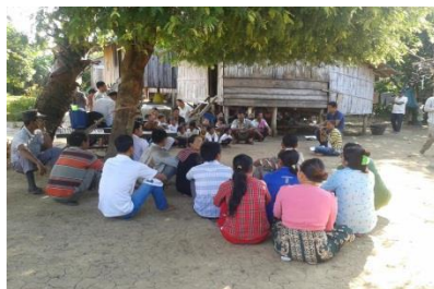
Engaging the community in a dialogue on education