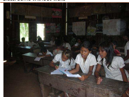
Students paying attention in class