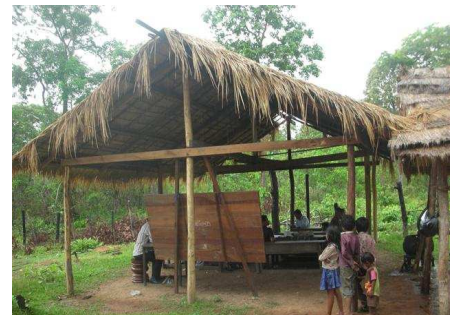
Classrooms without walls