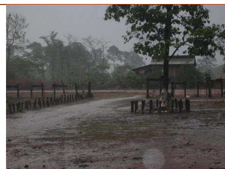
Around the school area