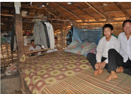
Inside the living space of the boarders. While these grass huts can provide shelter to boarders, it cannot protect them during the rainy season. Very often, their books are destroyed by the rain.