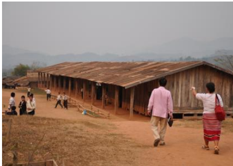
Welcome to Atxaiyaphoum Secondary School