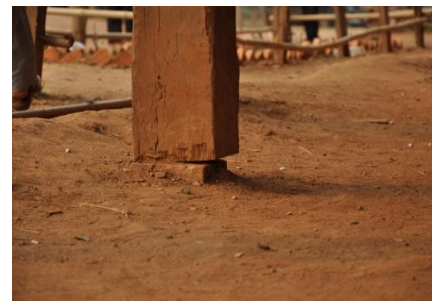
Exposed foundation which is no longer stable