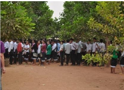
Students gathering before the end of school