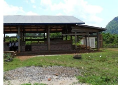
Half-completed, the classrooms lack walls