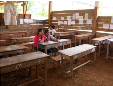
Inside one of the classrooms in the half completed building.