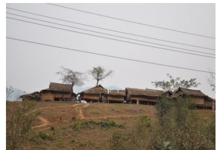
More than 120 boarders are living on the school premises.