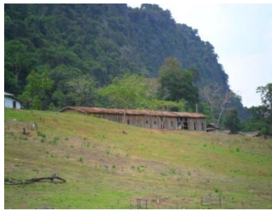
The older, wooden buildings