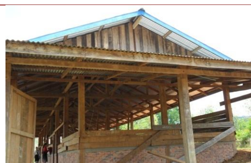
The half-completed building