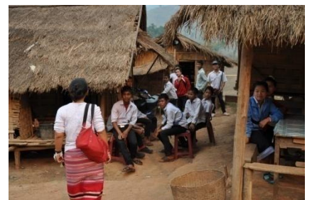
Our staff meeting with the boarders