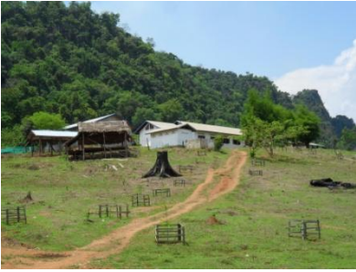
Welcome to Atxaiyaphoum Secondary School