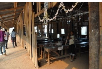
Inside the classrooms