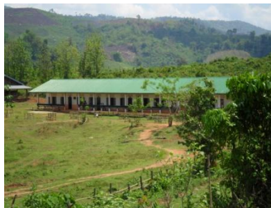
This building was supported by Room to Read in 2008