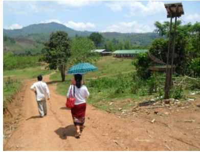
Walking towards the second cluster of classrooms