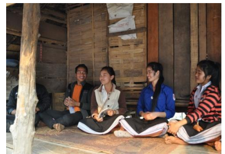
Talking with the students