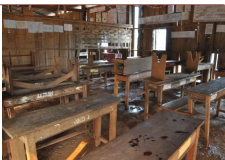
Students clean the classrooms before going home