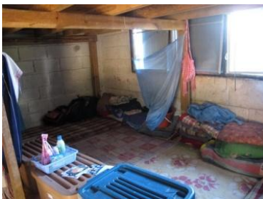
Inside the girls boarding house