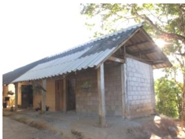
Outside the girls boarding house