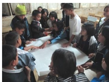
Together with the students we discussed the requirements for the new boarding house