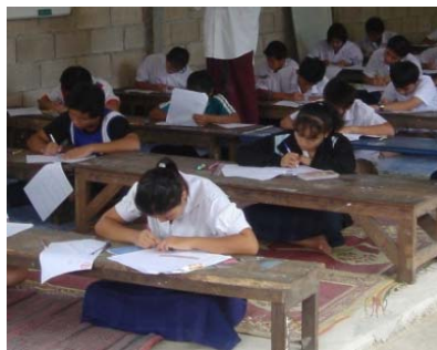
Students concentrating on their studies