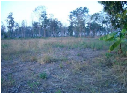
Spacious rural location for the new campus