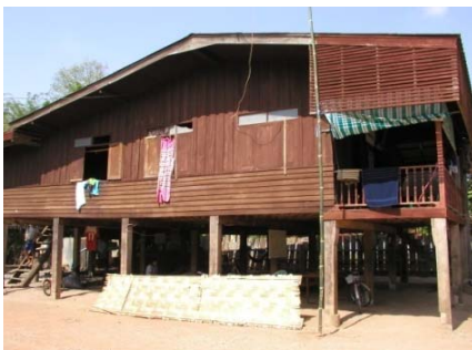
Old wooden house used as a school and boarding house