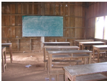
.... and from inside