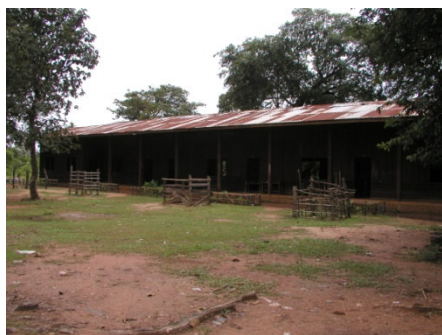
The school from outside...