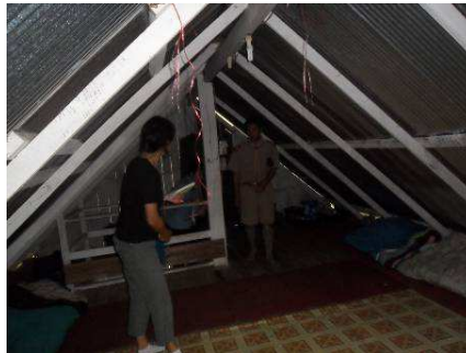
Some students live in the boarding house's attic.