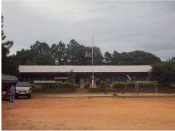
Baan Hua Mae Surin Primary School