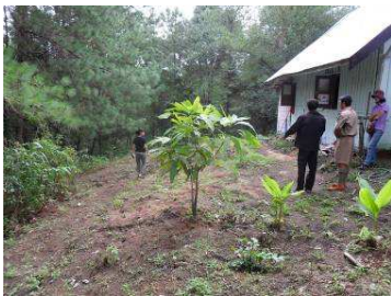
Surveying the environment...