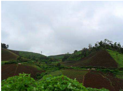
The mountainous terrain of Khun Yuam district.