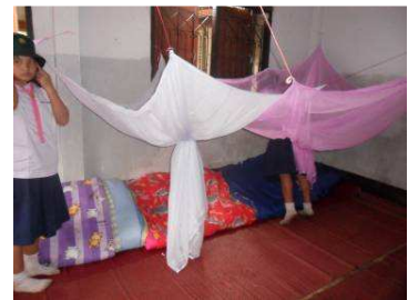
Neatly rolled up blankets that students sleep on