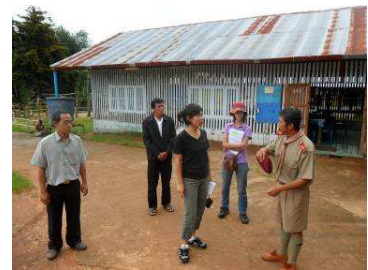
Engaging the community leaders