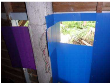
Plastic boards used as windows