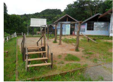
Playground for the children