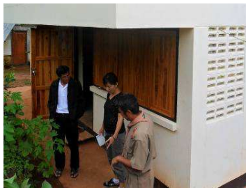
... And the boarding facilities