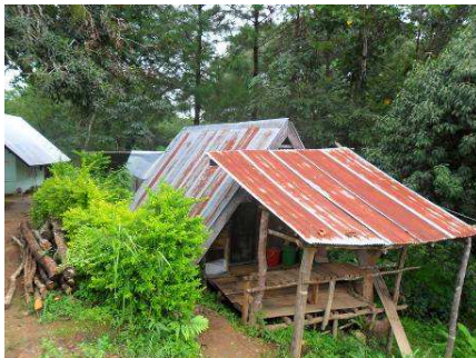
One of the existing boarding houses.