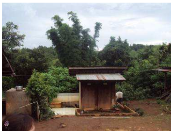
Toilets for the students