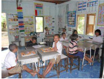
Students studying in the classrooms