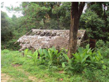
One of the boarding houses