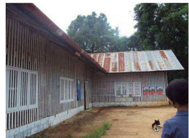
Wooden structures used as a canteen