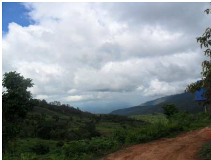
Huay Sompoi's beautiful surrounding landscape