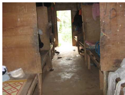
One of the old boarding houses