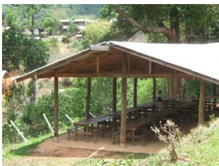
The school canteen