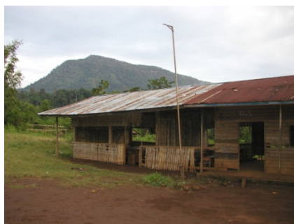
The school from outside...