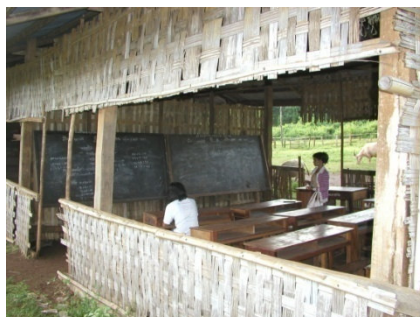
.... and from inside