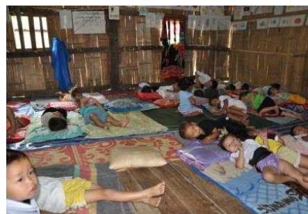
After lunch nap – inside one of the classrooms