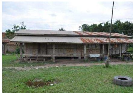
Welcome to Baan Mai Nursery School