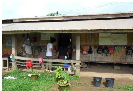
Small and rotten facility but very well organised