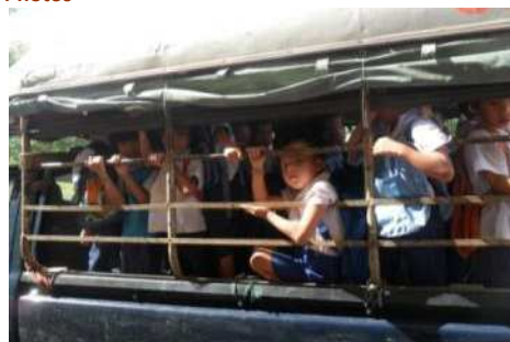
Children ready to go home on the school bus