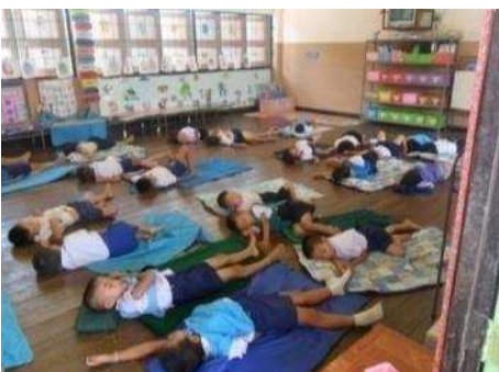
Taking a nap in the afternoon