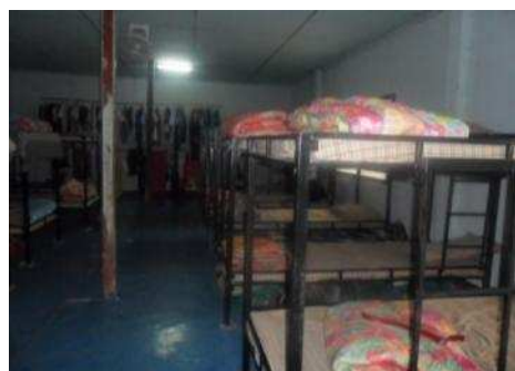
Inside the existing boarding house