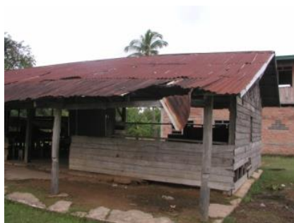
The school from outside....