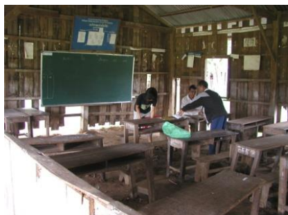
.... and inside