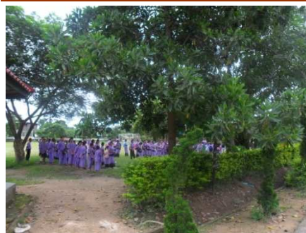
student on the school sports ground