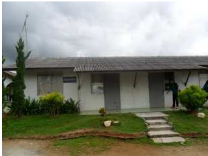
The existing boarding house is too small