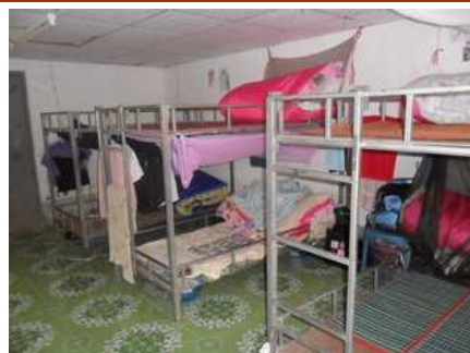
Insufficient space for all the students