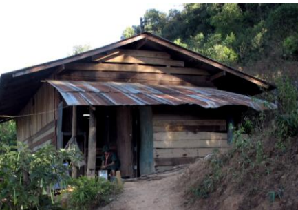
The boarding house at Baan Sompoi School