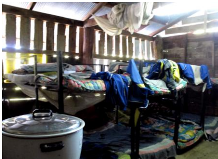
The boarding house is overcrowded and the physical condition of the building is very poor