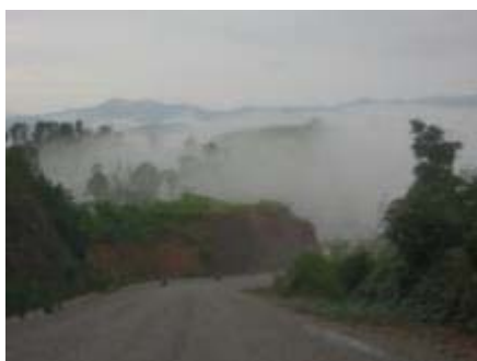
the road to Baan Thong