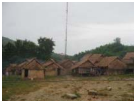
the "dormitories" – siblings live together in small houses and are basically self sufficient