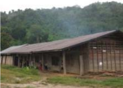
The school building