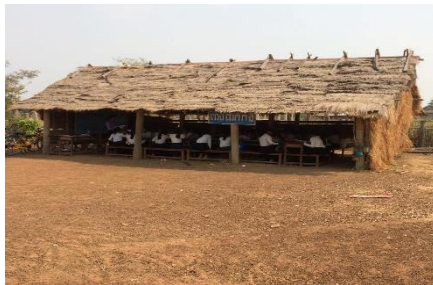
The temporary school building