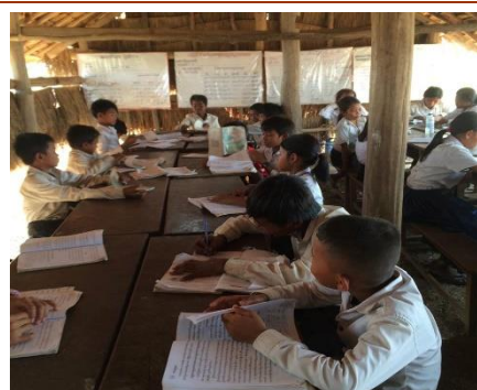
The facilities are very basic and unsafe