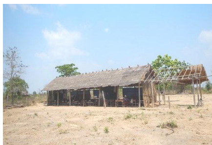
The rotten, temporary school building