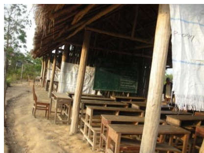
Inside the temporary school building