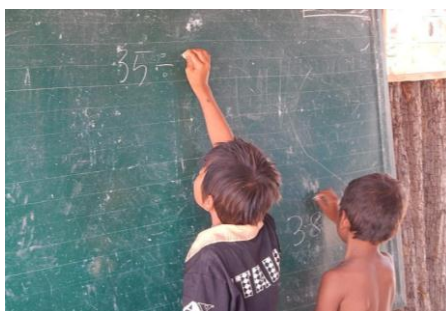
Students writing on the black board