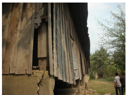
Unstable and termite infested wooden walls