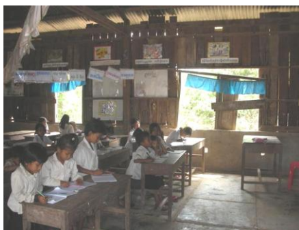
Dark classrooms with leaking roofs