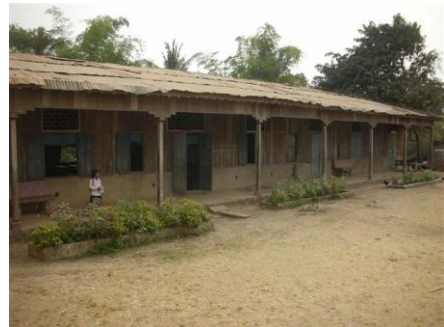
Welcome to Basaet Primary School