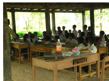
The classrooms were built by the community