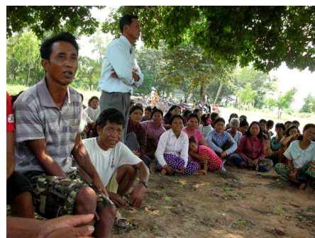
Meeting the community to understand their needs