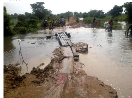
This is the usual route to the school