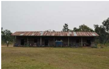
250 students attend classes in this building