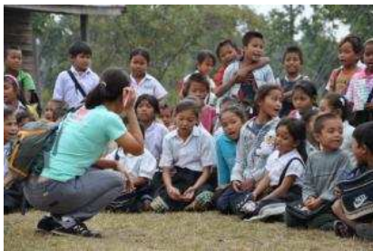
Child's Dream staff talking to the students