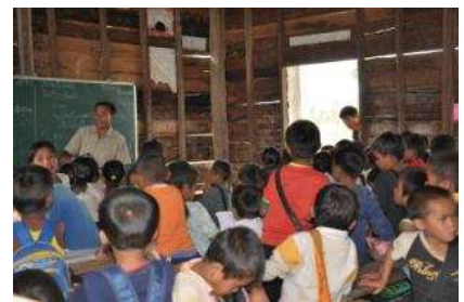
Overcrowded with students