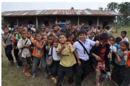
Many happy faces greeted our staff