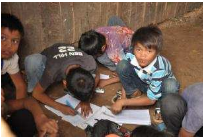
Some had to sit on the ground to write