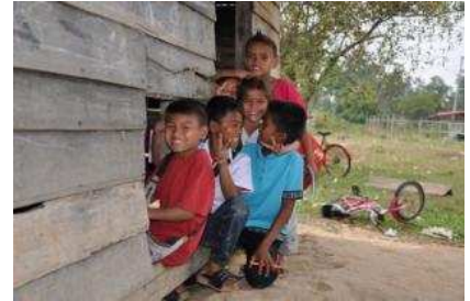
Students "spilling out" of the classroom