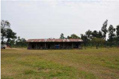
Small, but this building can accommodate 250 students