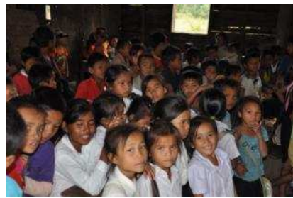
Students live in nearby villages