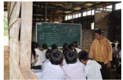
Paying attention in class