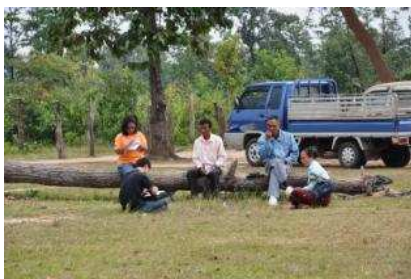
Meeting with the community leaders