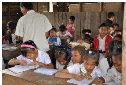
Eager to learn and study