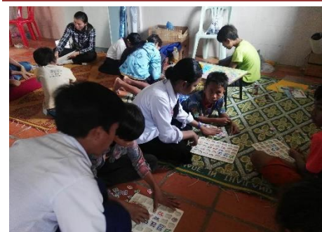
Space for the pupils to learn outside school hours with their peers and teachers.