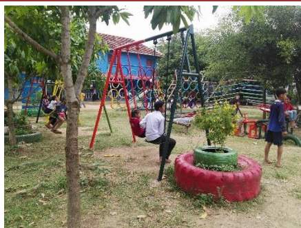
The playground built by Child's Dream in 2016.