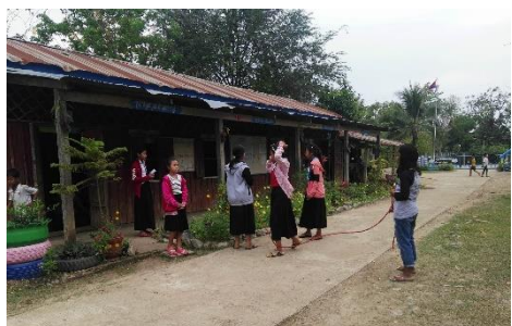
One of the on-campus wooden school buildings with the other situated opposite in similar condition.