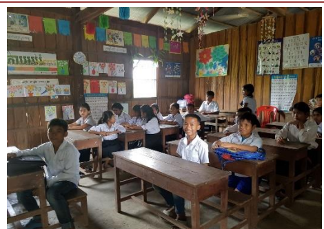
The inside of a classroom of the ramshackle wooden building with zinc roof, which can be badly affected by the heat during dry seasons.