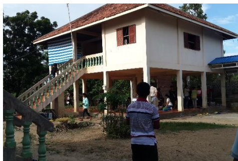
One of the residential houses constructed by Child's Dream in 2006