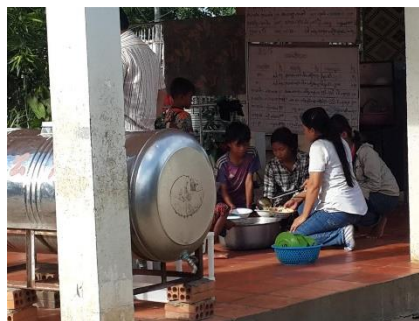
The houses aim to give the children a sense of privacy, respect and duty to maintain their space