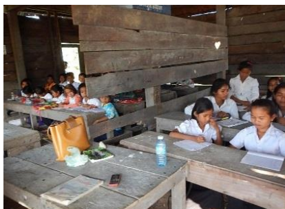
The two classrooms in building A are very crowded, dark and infested by termites.