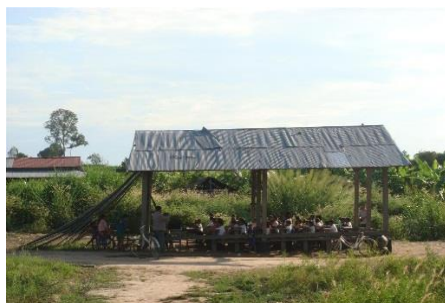
School building B has no walls and a leaking roof. It offers no protection from the elements.