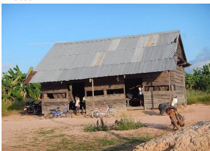
Welcome to Deichou Akpivath Primary School