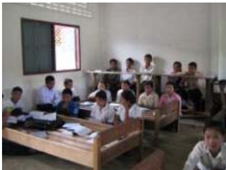
dormitory and class room "in one"