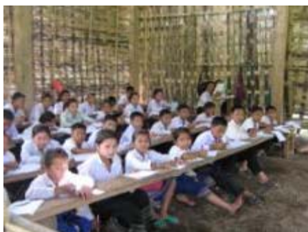
students studying in harsh conditions