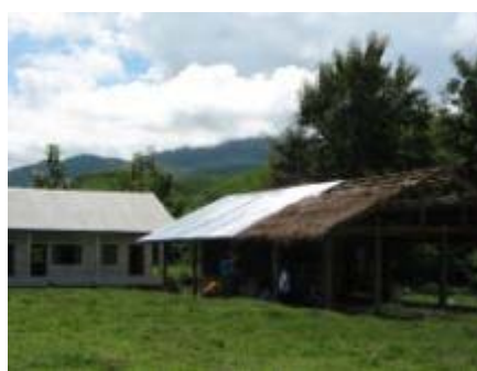
both existing buildings