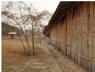
Damaged building from the outside