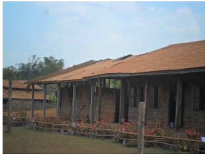
Welcome to Don Ton Lower Secondary School