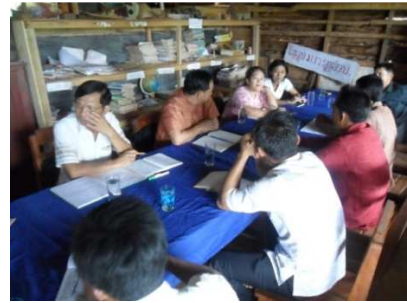
Last community meeting and signing the contract