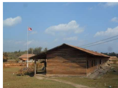
Thank you for your support! ☺