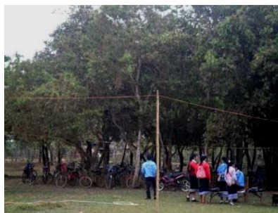
Students waiting outside the classrooms