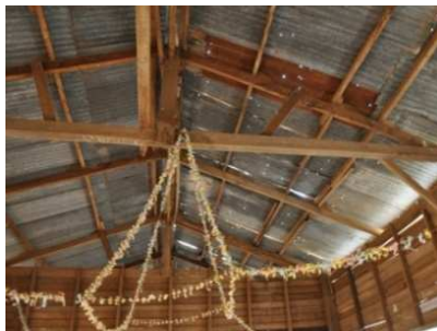
The leaking roof