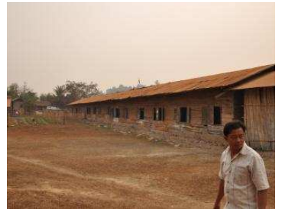
outside view of the classrooms