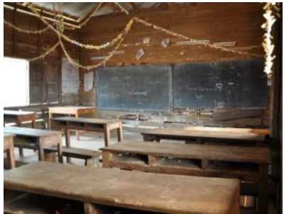
Classroom without students