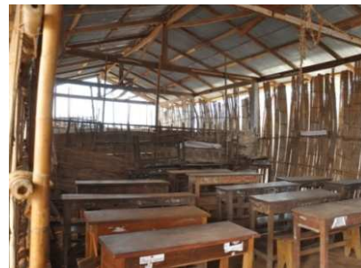
From the inside