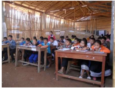
Classroom with enthusiastic students. The dirt floor is a problem when it rains