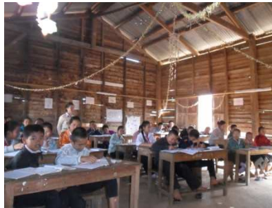
Classroom with students