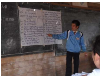
an English lesson takes place