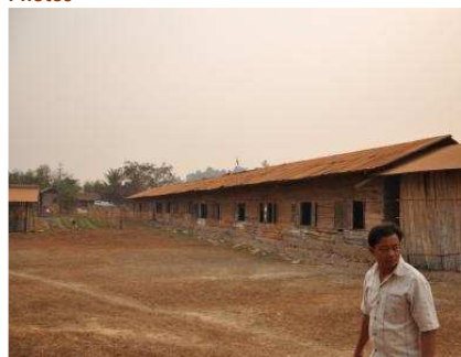
Welcome to Don Ton Secondary School