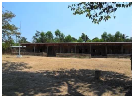
Welcome to Dong Geum Secondary School