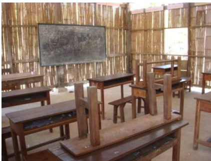
Inside one of the classrooms