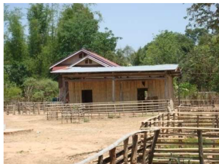
The smaller of the two buildings