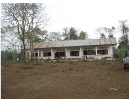
The existing, too small school building