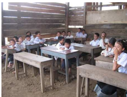
Kids in one of the additional classrooms