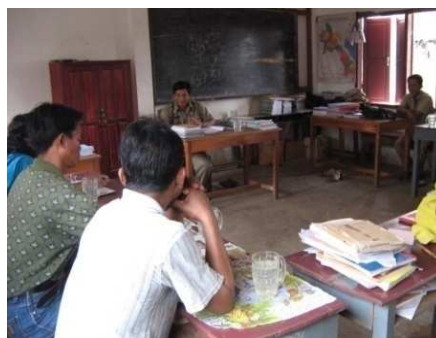
Villagers participating in the first meeting