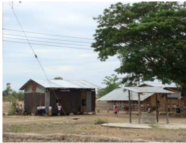
Built primarily from bamboo and some zinc