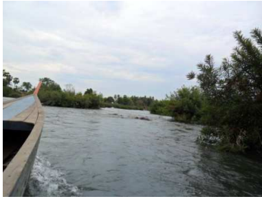
Journey to school, from the boat