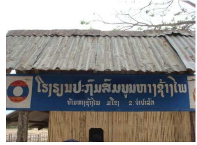
Welcome to Hang Xang Phai Primary School