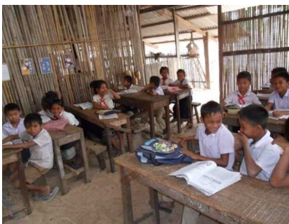
In class – children's chuckle fills the air