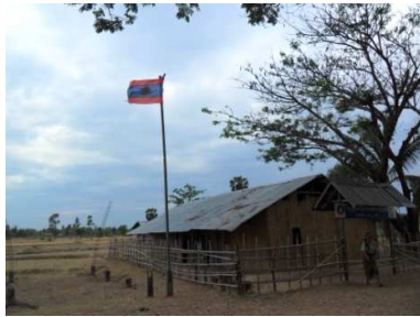
Two simple, rotten buildings