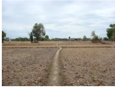
dirt roads leading to the village