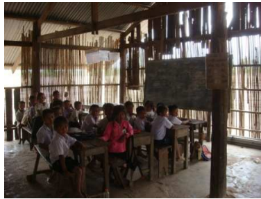
Inside the classrooms: Thin bamboo walls separates one class from another