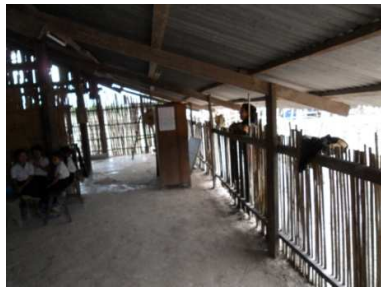
The facilities are no longer safe for learning