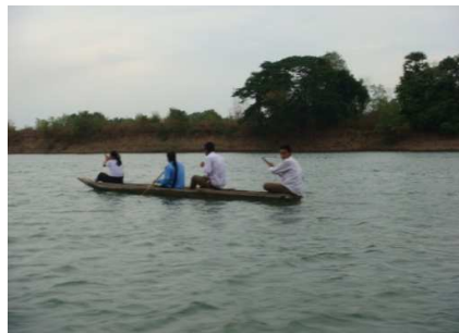
Everyday, students commute to school by boat