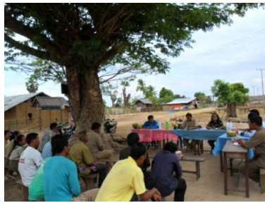
Child's Dream staff talking to the community