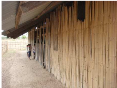
Students preparing for classes