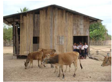
Cattles found roaming around the school