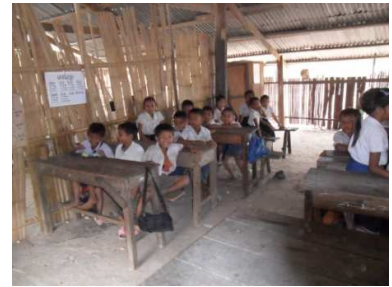
Our health specialist engaging the students