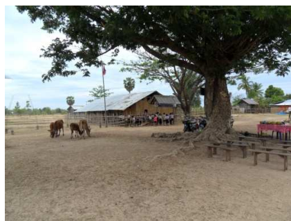
Some classes are conducted under this tree