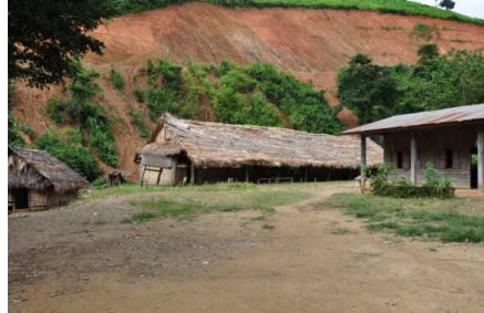
Welcome to Huay Yuak Secondary School