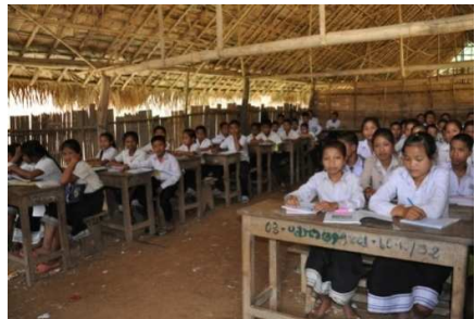
An encouraging sight for our team – classrooms that are filled with enthusiastic students.