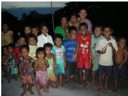
The children of Santey Village