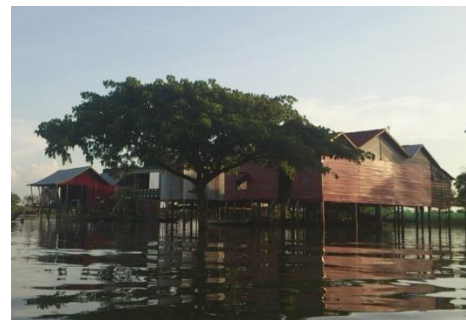
The villagers live on stilted homes on Tonle Sap lake