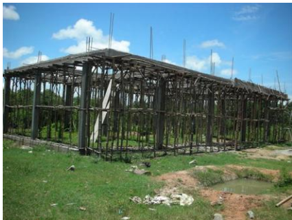
The unfinished building during the dry season