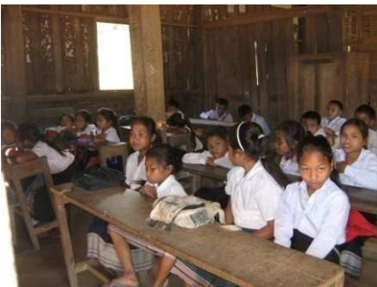
An inside view with primary students