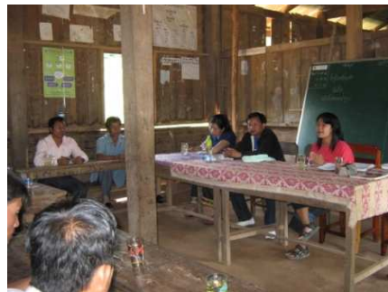
Discussing with the villagers