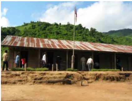
The school from the outside...