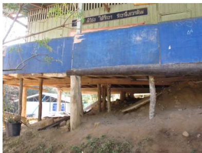
The foundation of the rotten school building