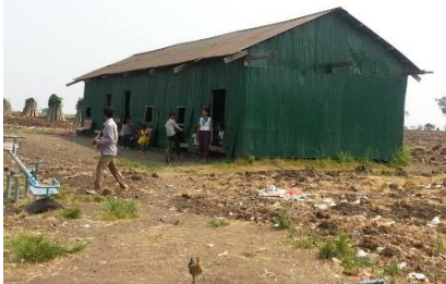
The existing school building made of tin walls