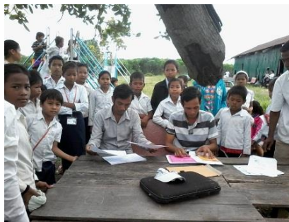
Engaging the community and the students in a dialogue on education