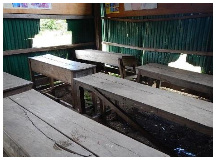
Inside the classrooms it can get very hot during the dry season and loud during the rainy season