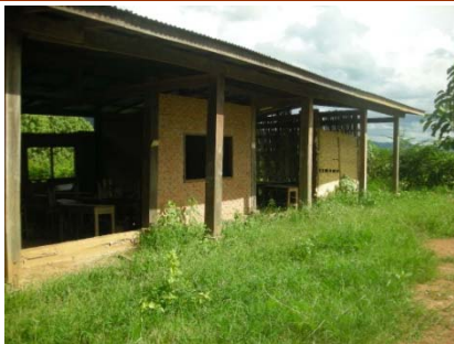
The old part of the school is in bad shape