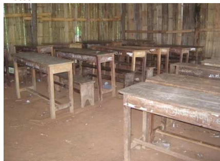
One classroom in need of renovating