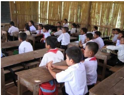
Inside one of the classrooms