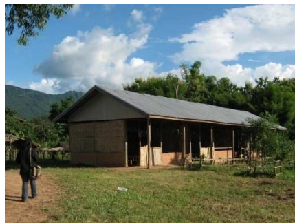
The smaller of the two buildings