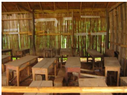
An inside view.....