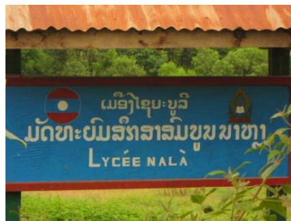
The school sign for "Na La"