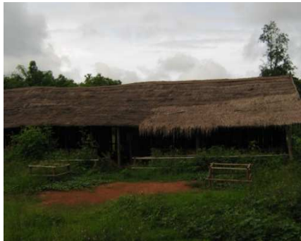
The school from the outside...