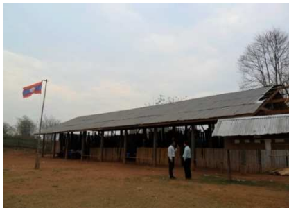
Welcome to Na Luam Secondary School