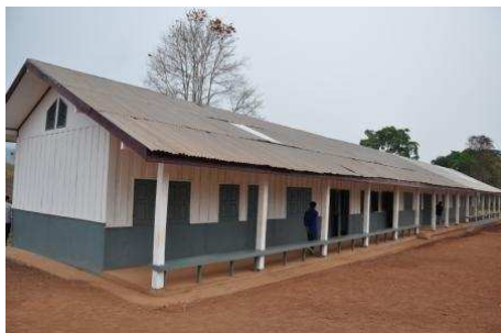
The current far too small school facility