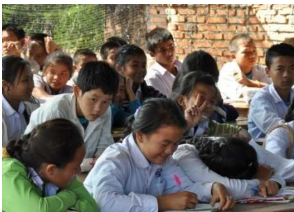
Many students are attending this school