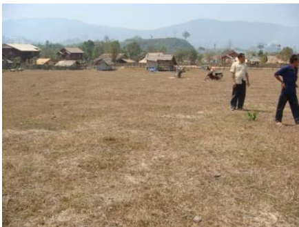
Discussing the location of....