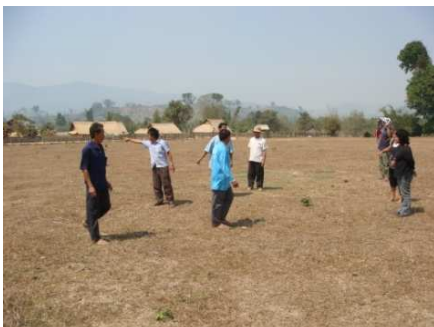
... the new nursery classrooms