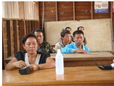
Villagers participating in the first meeting