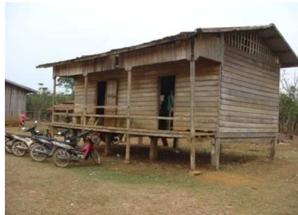
Welcome to Nong Bon Secondary School