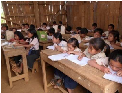
Inside one of the classrooms