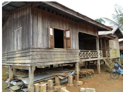
One of the rotten buildings