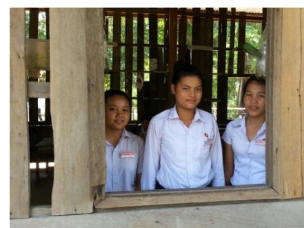
No secure learning environment for the students