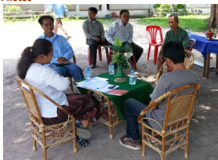
Meeting with the community in Nong Pham