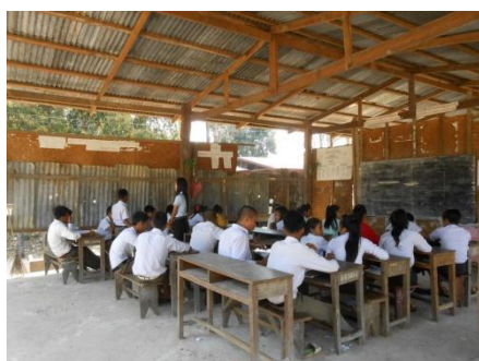
Termite infested, rotten buildings