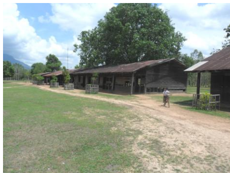
Welcome to Nong Tae Primary School