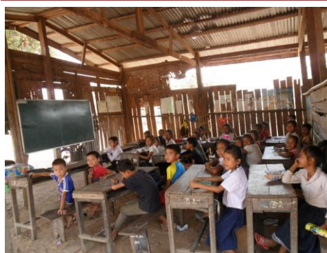
Classrooms with dirt floors, not usable during the rain