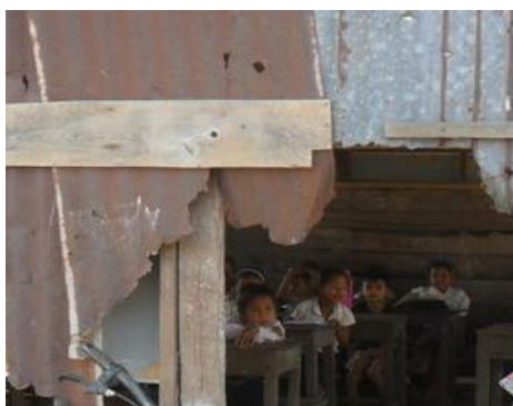
Patched up walls, exposed to the rain