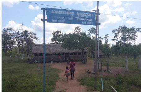
O Pram Pyiem Primary School