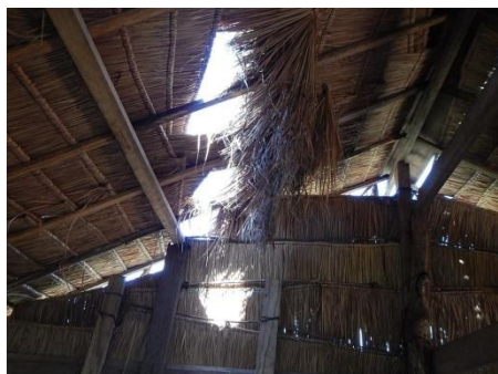
Thatch roof – or what is left of