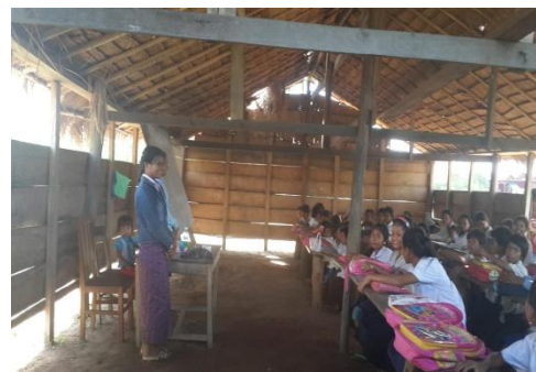
Crowded and noisy learning environment