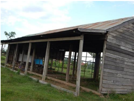
Welcome to O Takok Secondary school