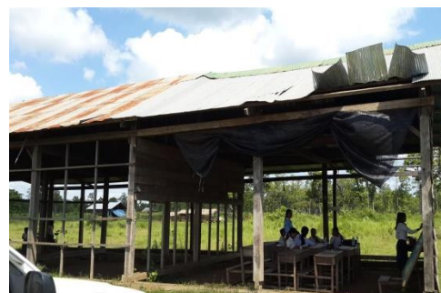
Class in O Takok secondary school