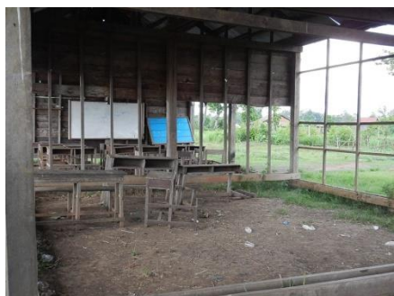
No walls to shelter from rain or dust