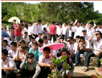
Not all of them are boarders