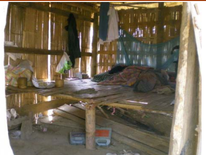
Inside one of the boarding houses