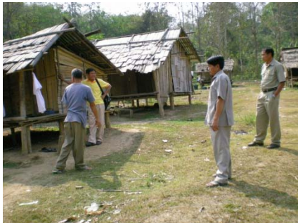
Current temporary boarding houses