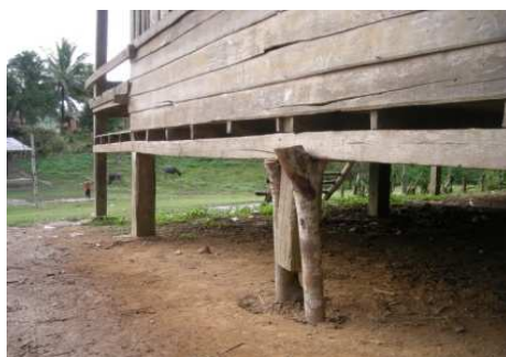
The existing building is unsafe for use...