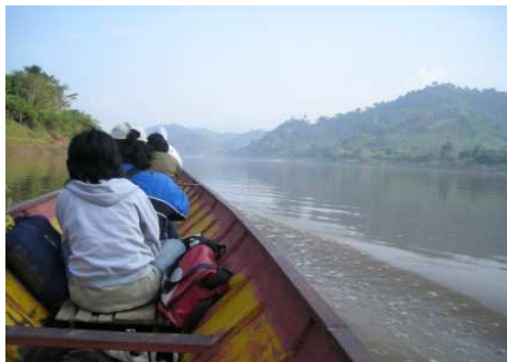
Paktung is very remote [on the Mekong]