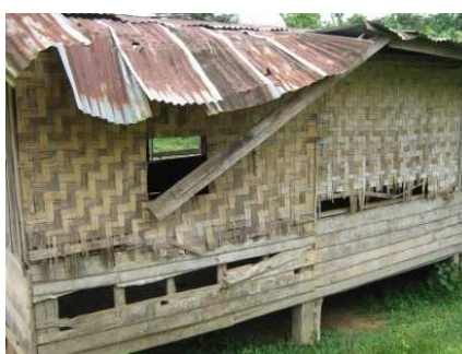
...and is in a very dilapidated state.