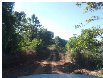
The road to Phandanluang