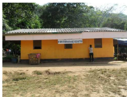
The existing small boarding house