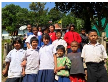
Children at Phandanluang