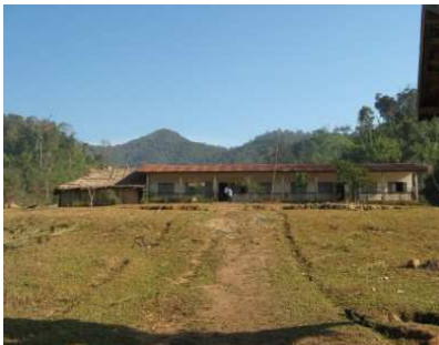
The bamboo nursery (left)