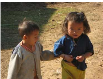
Pang Mon nursery school kids